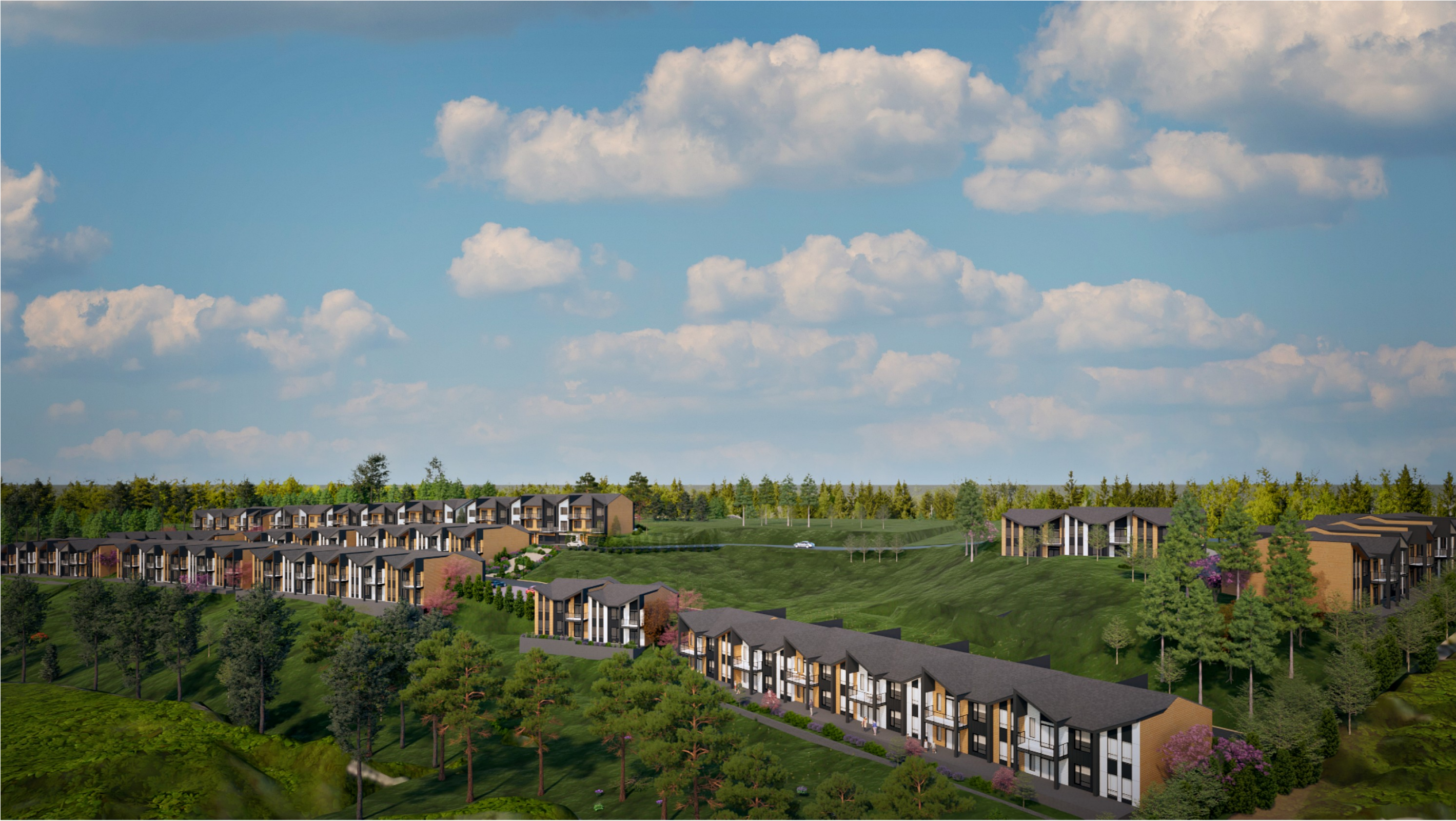
1 PERSPECTIVE VIEW

Notes This drawing, as an instrument of service, is the property of the Architect and may not be reproduced without their permission and unless the reproduction carries their name. All design and other information shown on this drawing are for the use on the specified project only and shall not be used otherwise without written permission of the Architect. Written dimension shall have precedence over scaled dimensions.