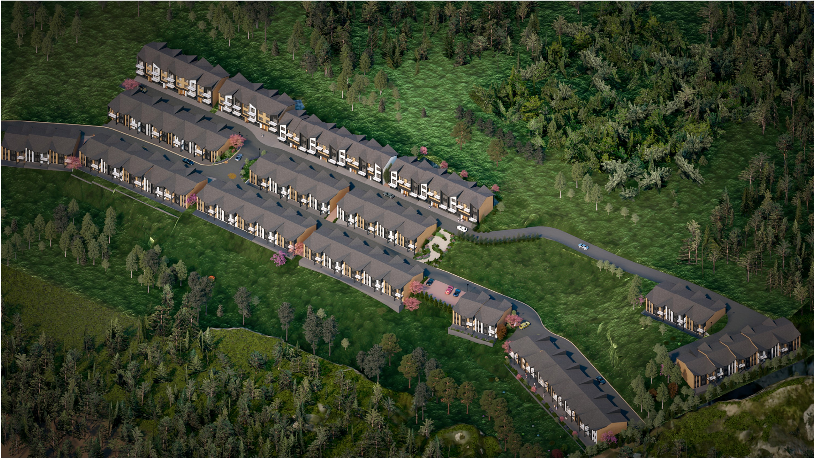
1 PERSPECTIVE VIEW

Notes This drawing, as an instrument of service, is the property of the Architect and may not be reproduced without their permission and unless the reproduction carries their name. All design and other information shown on this drawing are for the use on the specified project only and shall not be used otherwise without written permission of the Architect. Written dimension shall have precedence over scaled dimensions.